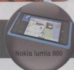
Nokia Lumia 800